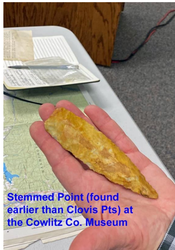
Stemmed Point (found earlier than Clovis Pts) at the Cowlitz Co. Museum